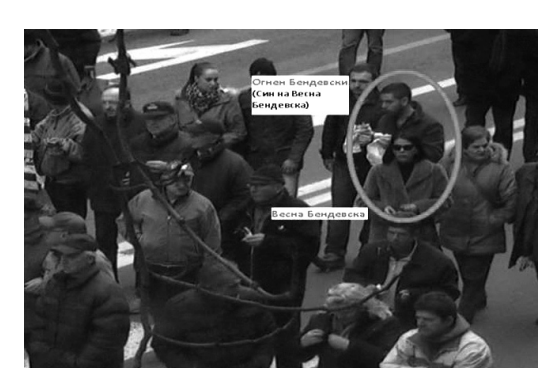
Photo: member of the opposition party SDSM and her son circled as participants in one of the student protests. ^{98}

While these photos did not show any insignia of a political party or organisation, one of the reports, which included claims that the protest had been instigated by the opposition, was accompanied by a photo taken from the Facebook profile of a protester in which she can be seen with an SDSM party flag. Her Facebook post is calling for support for the student protest. In another text, a photo of an older person supporting the protest with a student's grade book raised high was also used as an illustration of alleged party orchestration, while stating that "(elderly persons), most likely following party directives, joined the march".