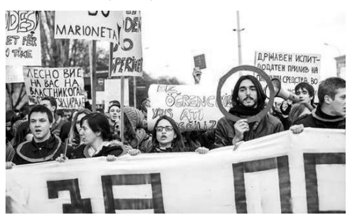
Photo: Students wearing paper circles around their heads mocking media that accused them of being orchestrated by the opposition party.<sup>171</sup>

Citizens who supported the cause of the students also marked themselves with red circles on their Facebook and Twitter profile pictures. The overall meaning of this was to point out that this labelling by the pro-government media as 'Sorosoid' or SDSM was used as a tool against anyone who expressed an independent opinion and disagreed with the government. Therefore, the circles that the citizens attached to their profile pictures were accompanied by the slogan "I think, therefore I'm marked". Thus, the students pointed to the absurdity of the claims of the media, stripped them of their intended meaning, and used them for self-promotion and mobilisation (getting supporters to help them to defeat the tactics of the media).<sup>170</sup>